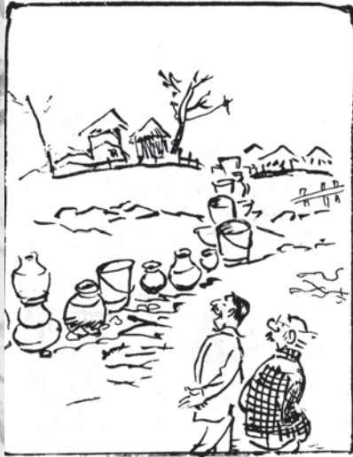
Not bad! One of the taps in the nearby village must be getting water!