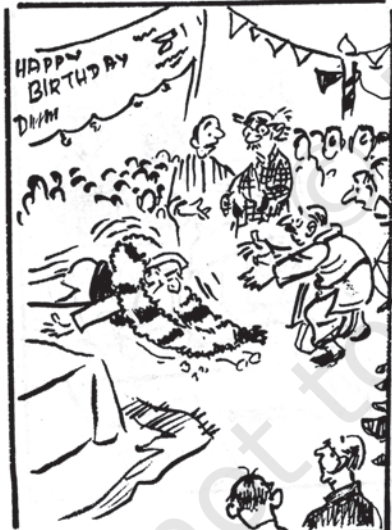
I told him to make the garland smaller... He is a frail old man and wouldn't be able to stand the weight of such a huge garland!