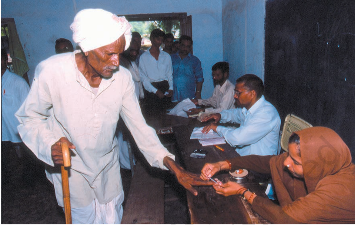
Voting in a rural area: A mark is put on the finger to make sure that a person casts only one vote.

election process. These representatives meet and make decisions for the entire population. These days a government cannot call itself democratic unless it allows what is known as universal adult franchise. This means that all adults in the country are allowed to vote.